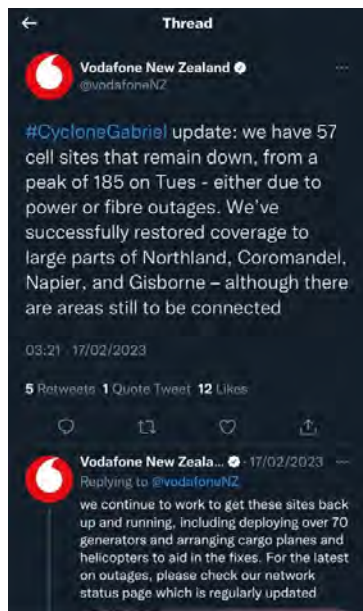
FIGURE 2 VODAFONE NEW ZEALAND RESPONSE TO CYCLONE GABRIEL (FEBRUARY 2023)

For people in societies without access to conventional documentation, blockchain IDs have been used to unlock better healthcare, education, employment, property rights and the right to vote. The World Food Programme has already established a closed blockchain ID system to support Syrian refugees in Jordan.